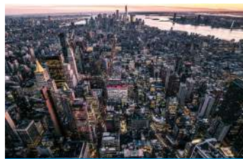
NEW YORK, NY