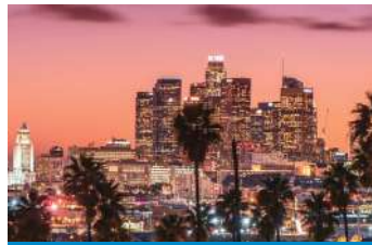
LOS ANGELES, CA